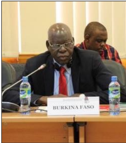
Salifou Diallo President of the MPP, Burkina Faso 9 May 1957 – 19 August 2017