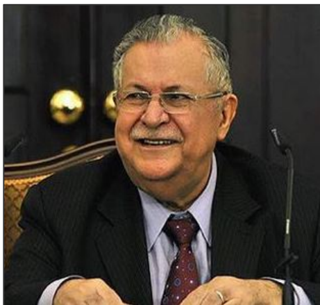
Jalal Talabani President of Iraq Founder and Secretary General of the PUK, Iraq SI Honorary Vice-President 12 November 1933 – 3 October 2017