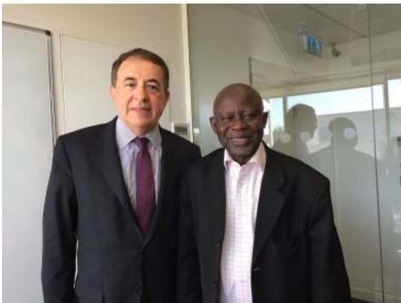
Ousainou Darboe, arrested leader of the UDP Gambia, at the offices of the SI in London at a recent meeting with the Secretary General of the SI

scheduled for December this year must become, for the first time in the political history of the country, truly free and fair.