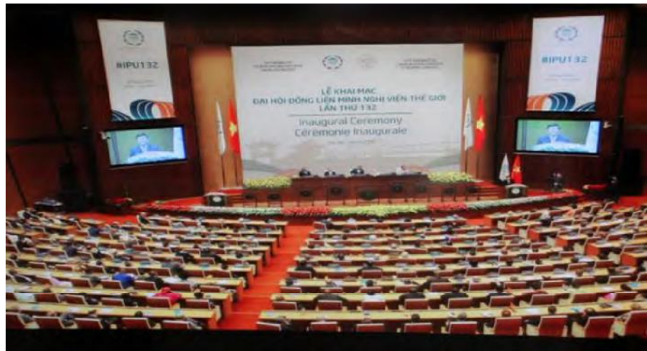
132nd IPU Assembly, Hanoi

On the occasion of the 132nd Assembly of the Inter-Parliamentary Union (IPU) held in Hanoi from 28 March to 1 April 2015, the Socialist International organised a meeting, as it has at previous IPU Assemblies, of parliamentarians from SI member parties. The discussions included an overview of current international developments of common concern, reports from members on issues of interest to their national delegation and an exchange of views on the main themes of the IPU agenda.