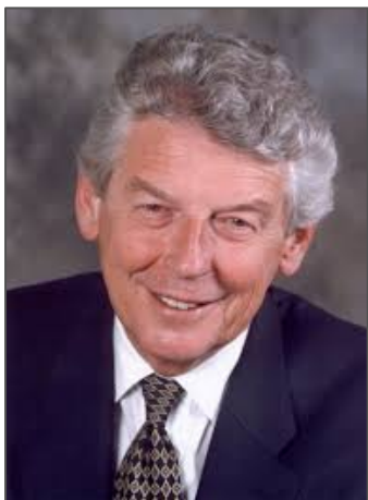
Wim Kok Former Prime Minister of the Netherlands and former Vice-President of the Socialist International