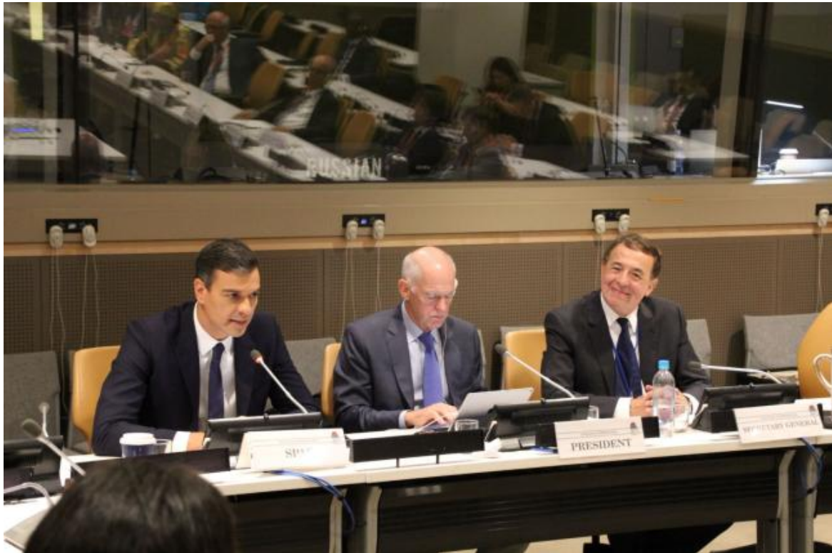
Pedro Sanchez, George Papandreou, Luis Ayala

The Presidium of the Socialist International held its annual meeting in conjunction with the high-level segment of the UN General Assembly at the United Nations headquarters in New York on 27 September 2018. The members of the Presidium, along with invited heads of state and government and a number of ministers from SI member parties, focused their exchanges on the key issues for the global social democratic movement at the present time. The agenda for the meeting included the current international situation and global challenges that arise for the social democratic movement; emphases and priorities to ensure that the multilateral system effectively secures peace and sustainability and respect for freedoms and rights for all; and how to reinforce the foundations of our global society in these troubled times.