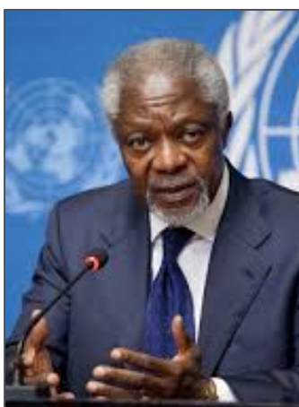
Kofi Annan Secretary General of the United Nations, 1997 – 2006